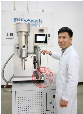
The Mini Spray Dryer YC-500 - innovative solutions for spray drying in the laboratory

The impressive features of the Spray Dryer include its efficient performance with very short set-up times, an effective integrated nozzle cleaning mechanism and a high degree of flexibility thanks to the different cylinder geometries. The system was designed to be stand by a keyboard, conducted by a colorful crystal screen of touch guidance mode, and allowed two modes of run: Automatic-mode, and Eye-monitored mode for the purpose of easily controlling experimental process.